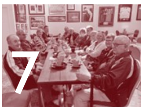
Another Life Café and Wares