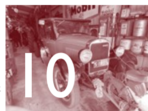
George's, Antique & Memorabilia Run