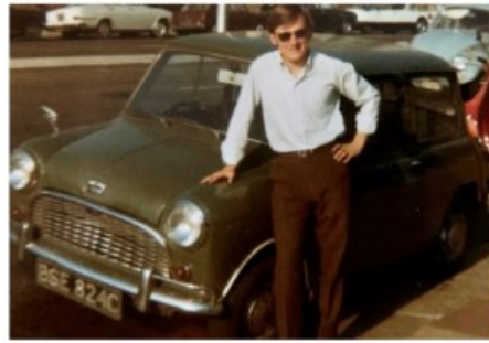
Second car in 1970 while in England. Austin Mini 1965