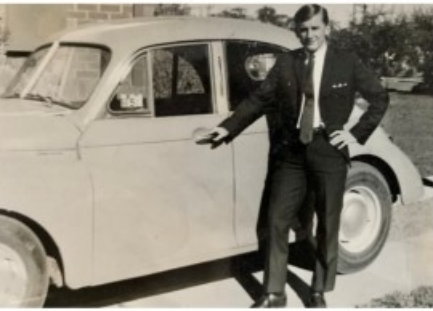
First car in 1968, Morris Minor 1955