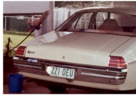
Bought '78 Holden Kingswood in 1982