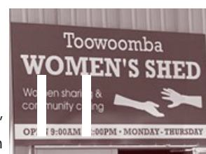
"Around The Sheds" Restoration Run