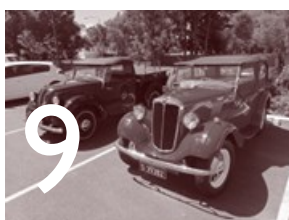
TDMG Christmas Party, Blue Mountain Hotel