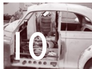
-MC is back with Project Noddy #3