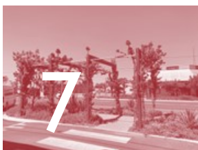
CAR Inc run to ANZAC Park, Miles