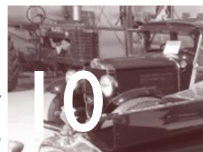
50th Anniversary Warwick Veteran and Vintage Motor Club