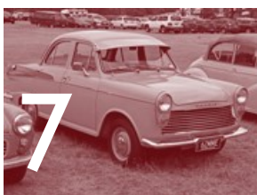
Photos: Run to Cabarlah Markets